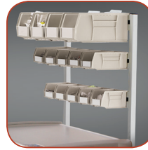
Bulk Storage Bins