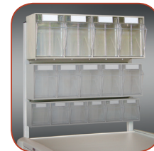
Tilt Bin Organizer