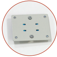
Infection Control Wipes Bracket