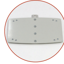
Sharps Container Bracket