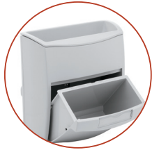
Locking Side Bin with removable bin